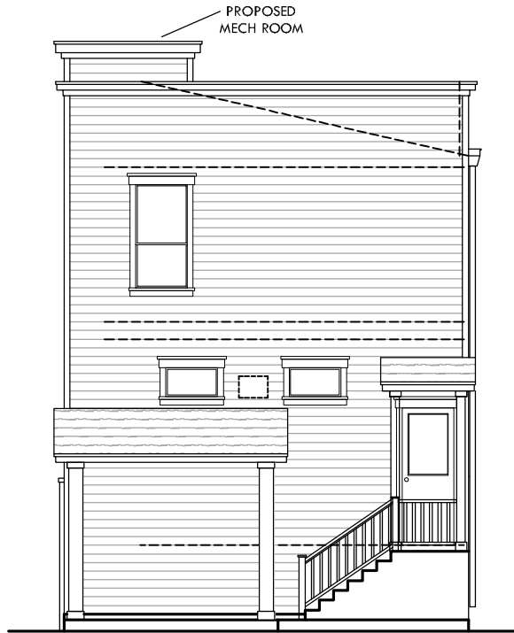
REAR ELEVATION 12'