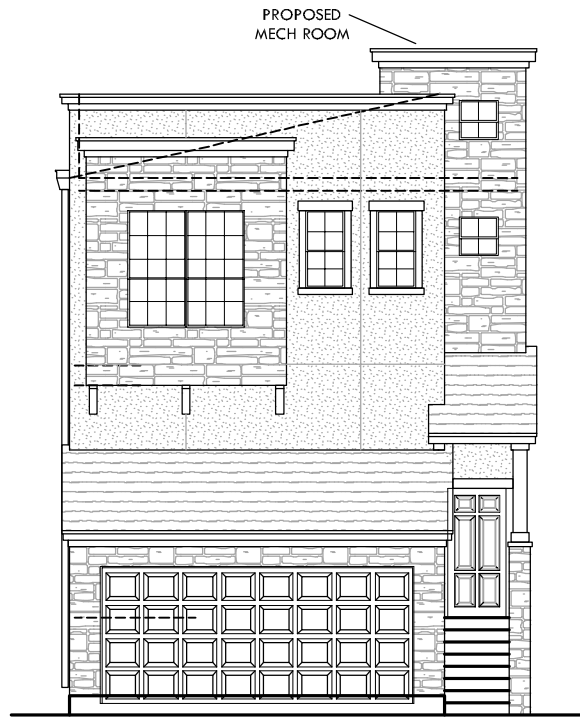
FRONT ELEVATION 12'